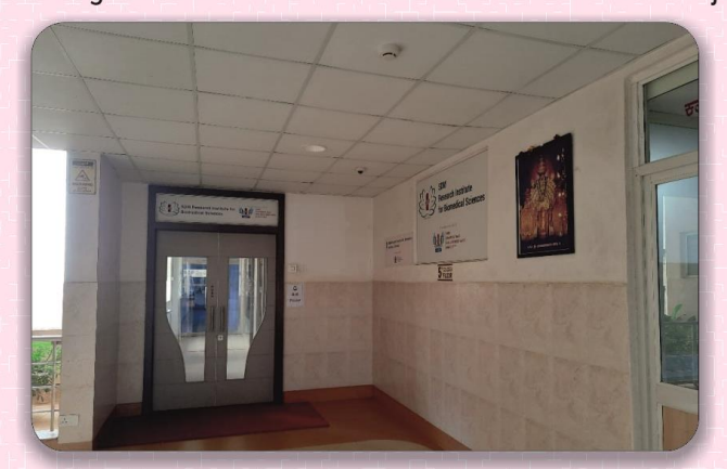
SDM Research Institute for Biomedical Sciences