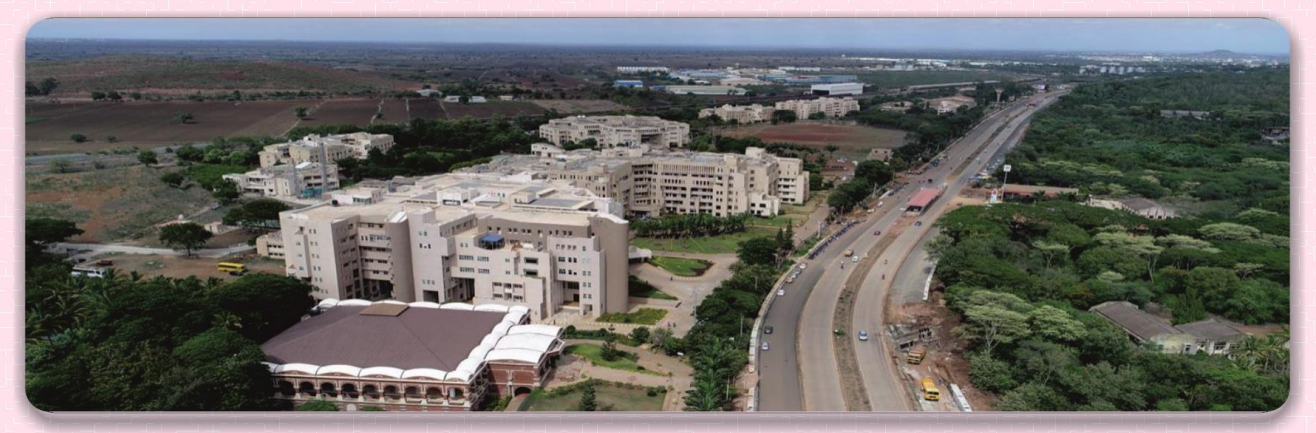
Panoramic View of Campus