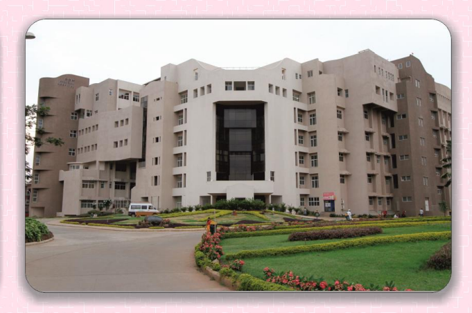
Shri Dharmasthala Manjunatheshwara University